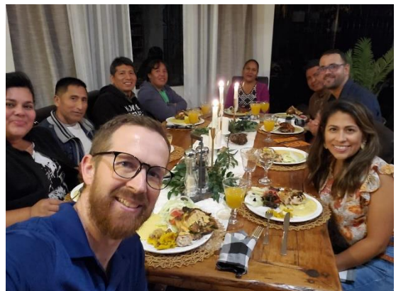
Our leadership team

As each person shared, they unanimously agreed to re-launch the church.